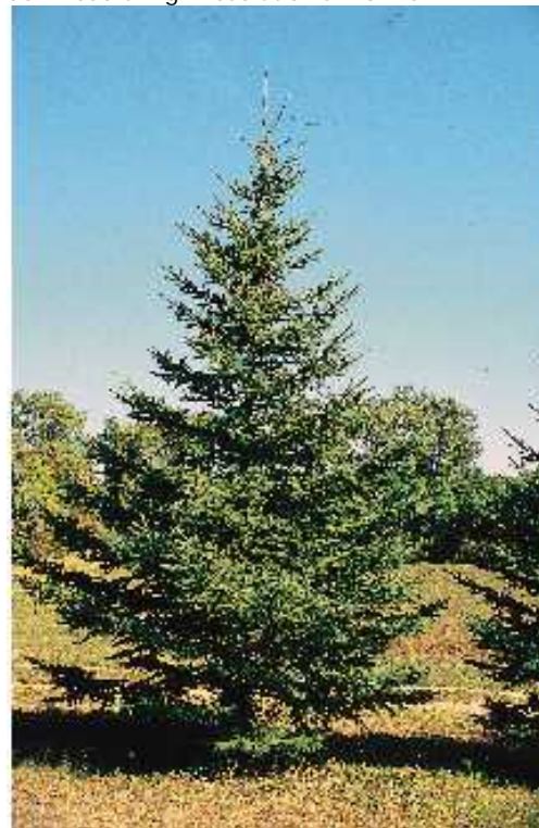
Picea glauca var. densata

Click on the image below to enlarge it and download a high-resolution JPEG file.